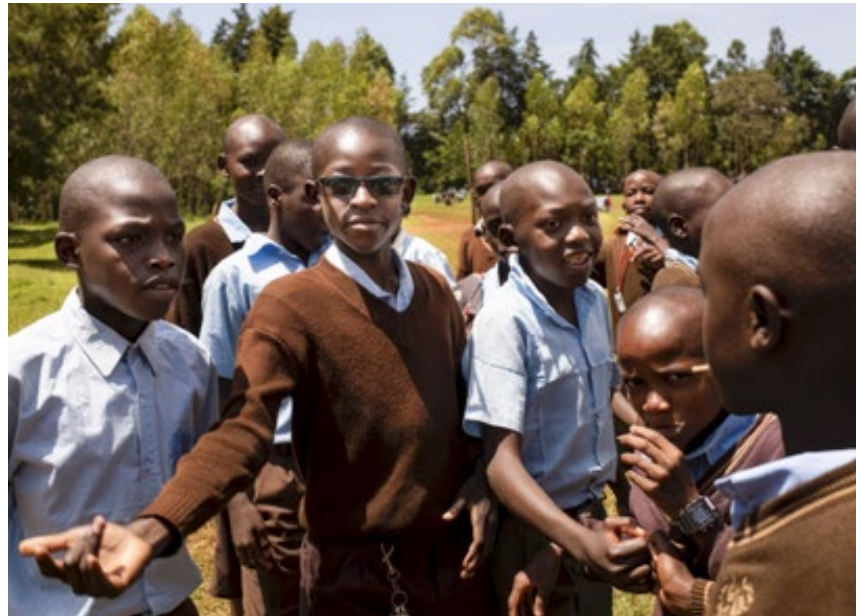
Spectacles improve access to education. KENYA

Globally, it is estimated that only around one-third of people with vision impairment due to refractive error have access to a pair of spectacles that can effectively address their refractive error and allow them to see well. 1 In recognition of the fact that uncorrected refractive error is the leading cause of near and distance vision impairment worldwide, and that spectacles are a very cost-effective intervention, a new global target for refractive error was endorsed at the World Health Assembly in 2021. Specifically, the global target is to increase the percentage of people with access to appropriate spectacles (known as effective coverage of refractive error, or eREC), by 40 percentage points