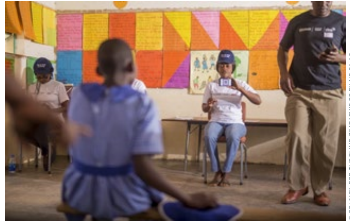
A child is screened for refractive error in her school. ZIMBABWE