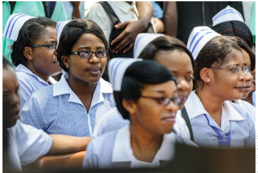
Ophthalmic nurses attend World Sight Day celebrations. SOUTH AFRICA

Sub-Saharan Africa does not yet have enough eye health workers to help the millions of people suffering from eye disease in this region. This article explains the challenges in sub-Saharan Africa and the efforts underway to train and empower more eye health workers.